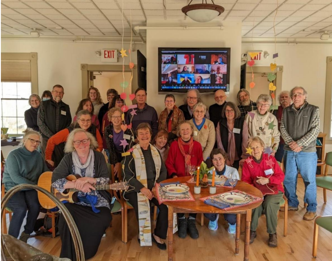
Thanksgiving Service 2023