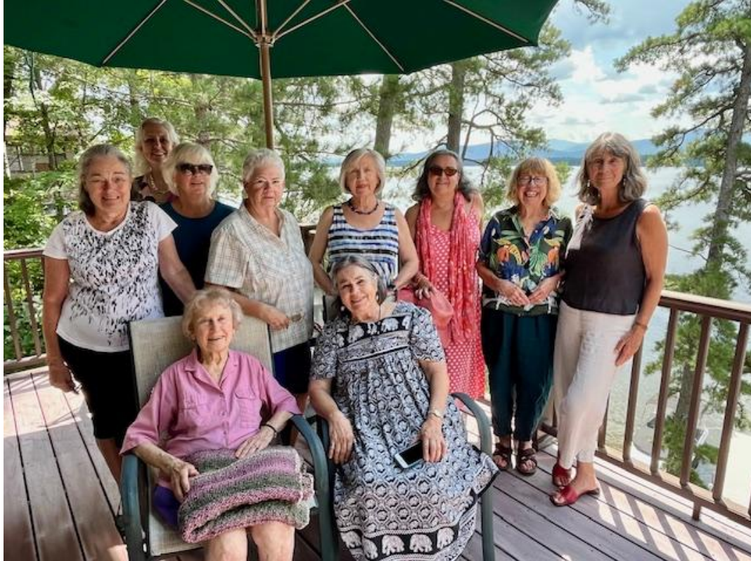
UUFES Women in July

Women's Luncheon (cis, trans, non-binary inclusive) 1st Thursday, 12 noon - During the summer, at people's homes