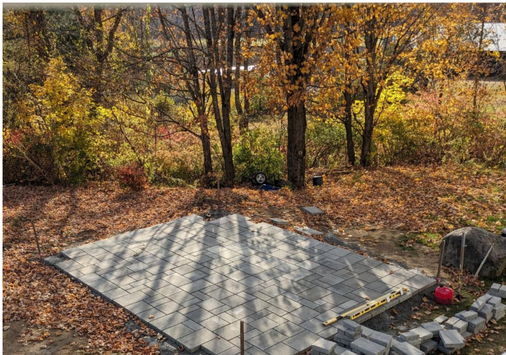
Gazebo foundation takes shape....