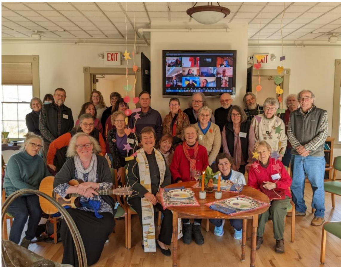
Thanksgiving Service 2023

Zoom service link: https://uuma.zoom.us/j/92959299766