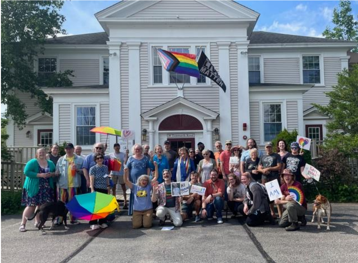
The Tamworth Pride Saunter, June 30