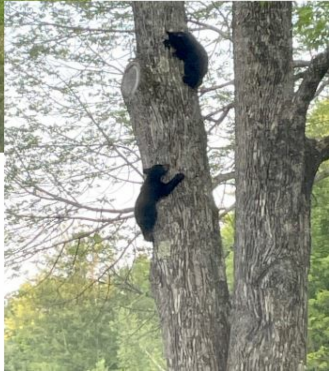
Bears Visit the Hoffmans