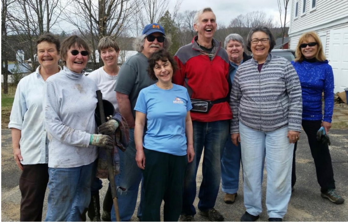
2018 Fall Clean-Up Crew