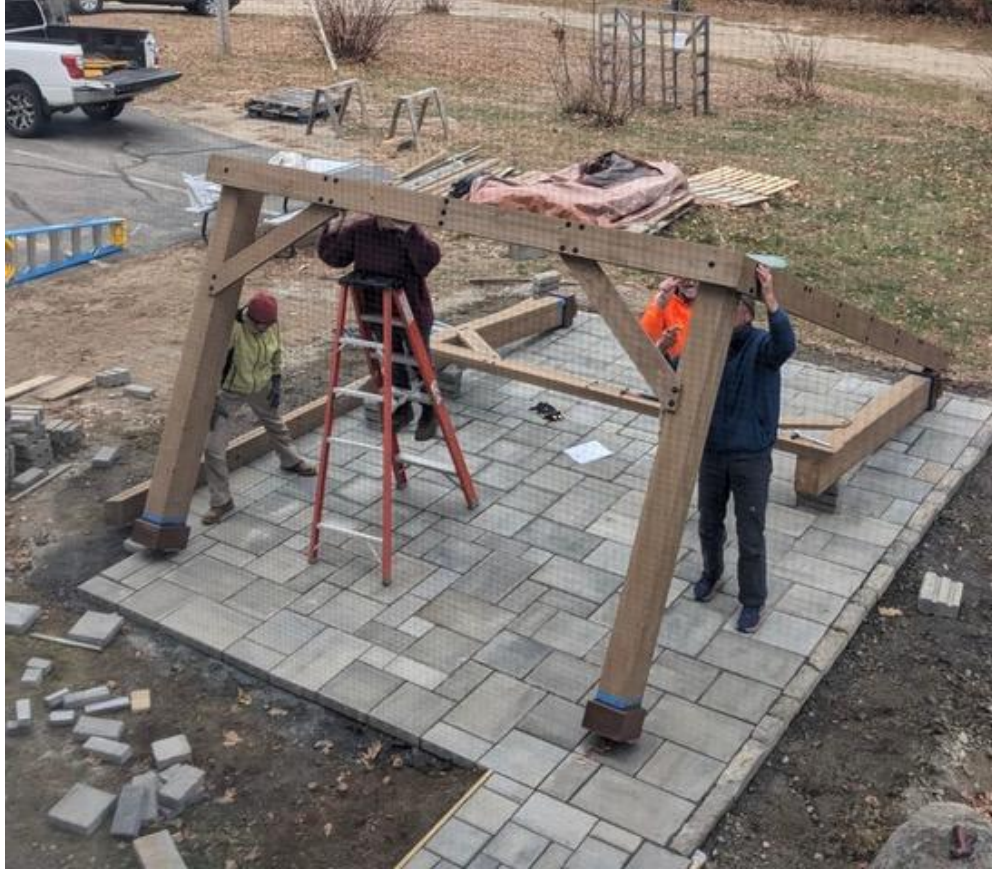
Gazebo goes up....